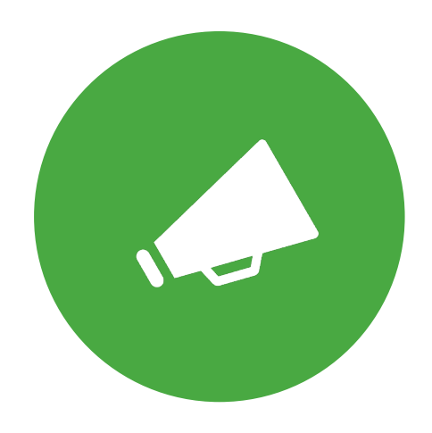
VOICE OUR VALUES

Ensure all people and nature have a voice