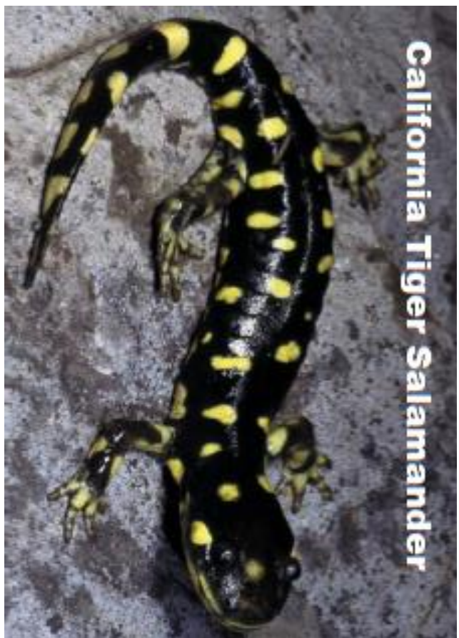
California Tiger Salamander